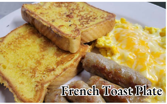
French Toast Plate