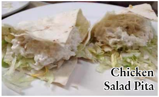
Chicken Salad Pita