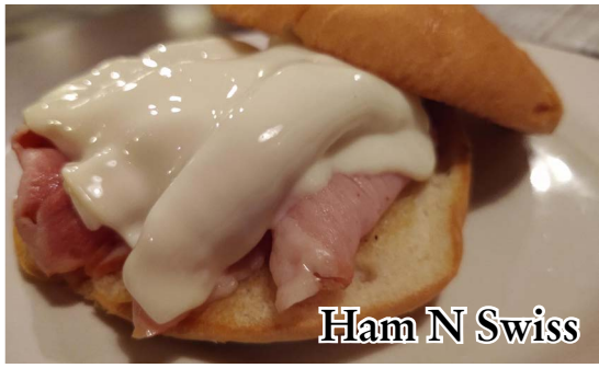
Ham N Swiss