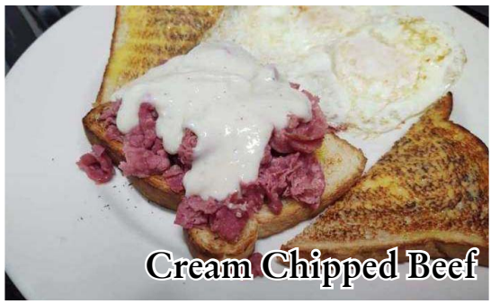
Cream Chipped Beef