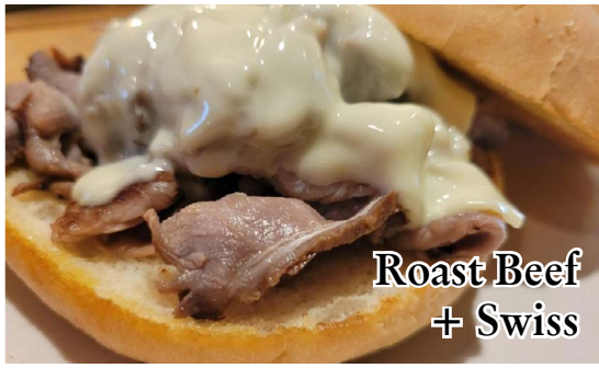
Roast Beef + Swiss