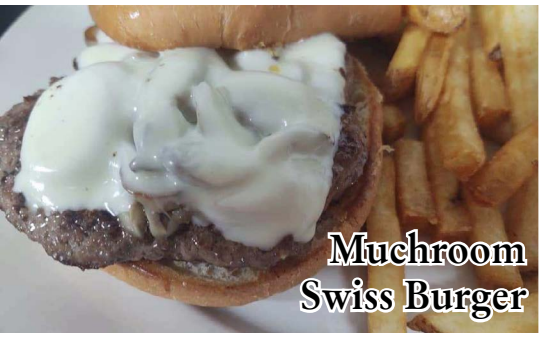
Mushroom Swiss Burger