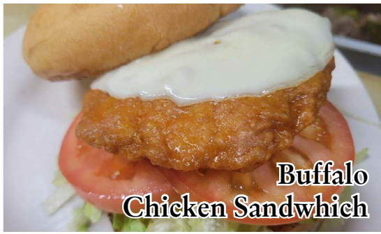
Buffalo Chicken Sandwich