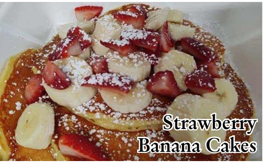
Strawberry Banana Cakes