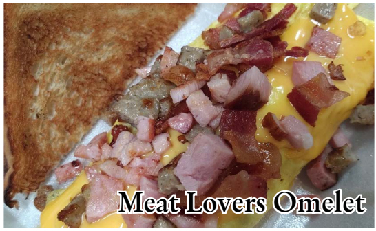
Meat Lovers Omelet