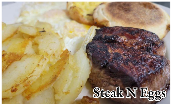
Steak N Eggs