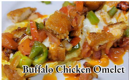
Buffalo Chicken Omelet