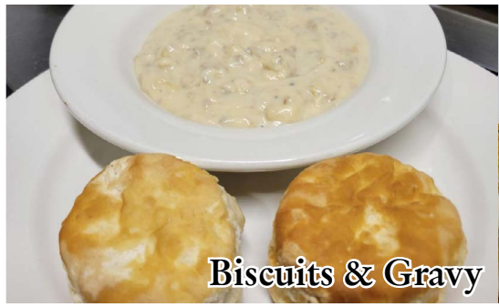
Biscuits & Gravy