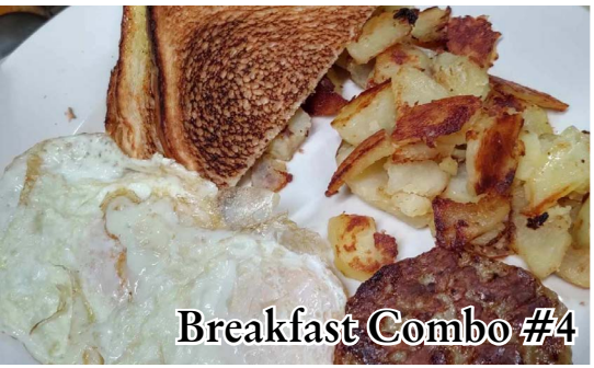
Breakfast Combo #4