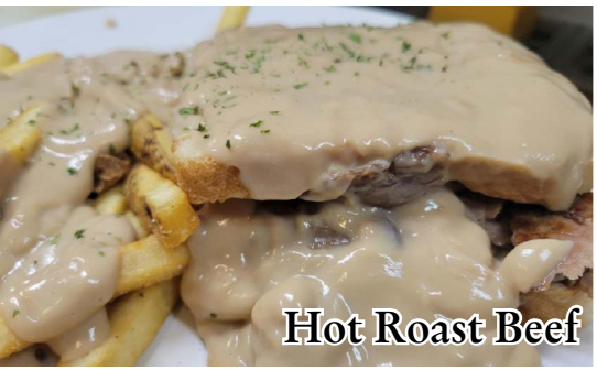
Hot Roast Beef