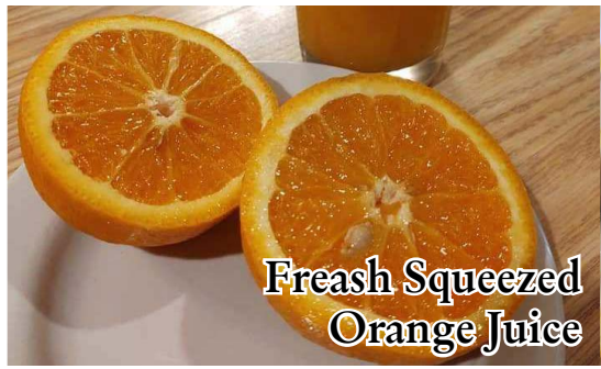
Fresh Squeezed Orange Juice