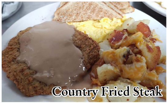
Country Fried Steak