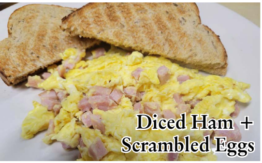
Diced Ham + Scrambled Eggs